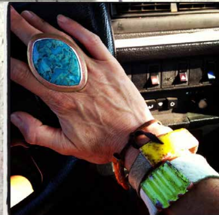
One of a Kind Stone Rings

Caste Sterling Silver Band - custom order $300