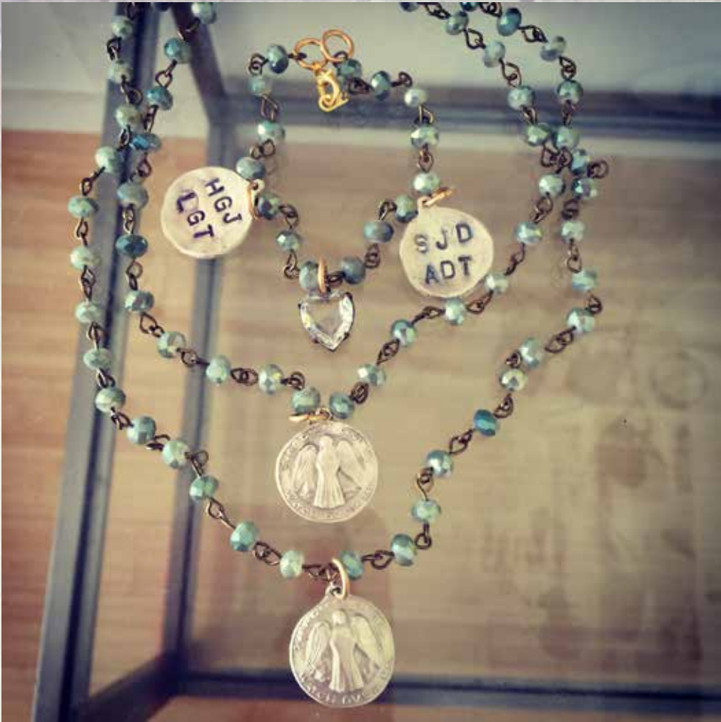
Guardian Angel Necklaces - $165.00 Made of caste silver and can be customized with the initials of your Guardian Angel.