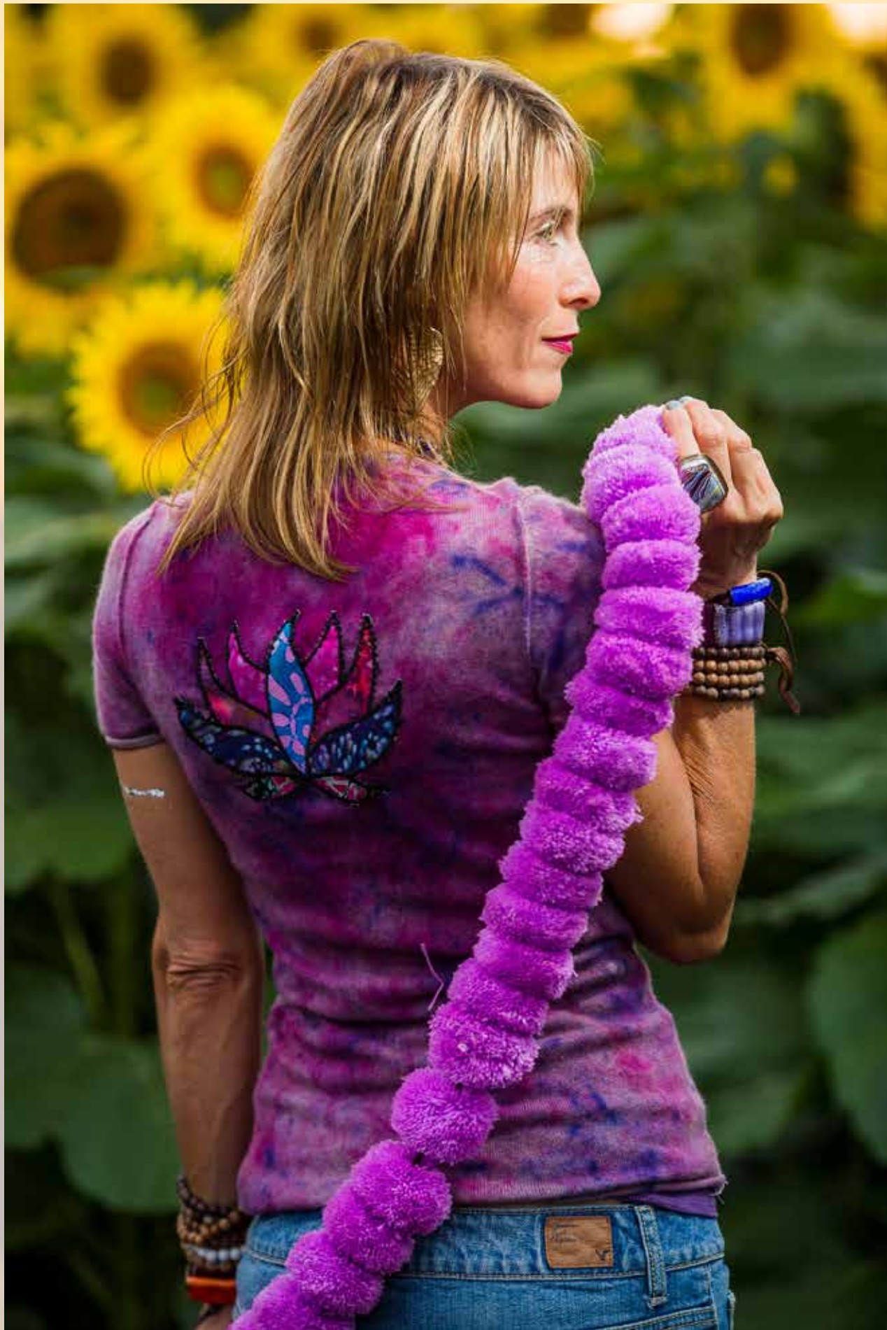
Recycled Cashmere Lotus Sweater Acid Dyed, Size Small $300.00