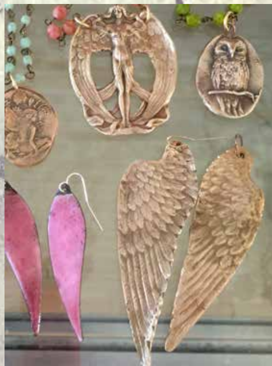
Angel Wing Earrings - $145.00 Caste Bronze