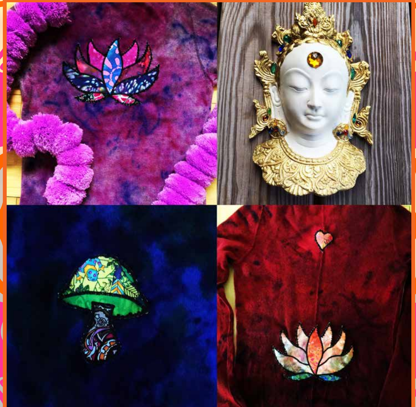
Recycled Acid Dyed Cashmere Sweaters - $300.00 One of a Kind