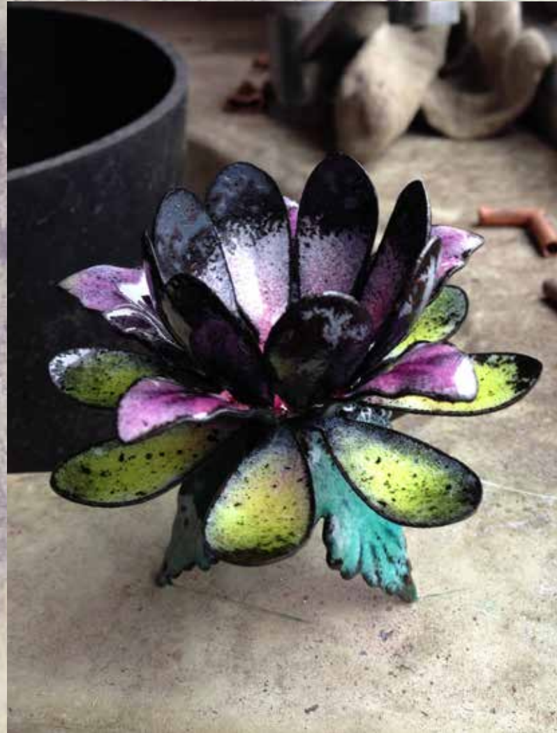
Welded Steel Enamaled Lotus Votives One of a Kind, Handmade $85.00 each