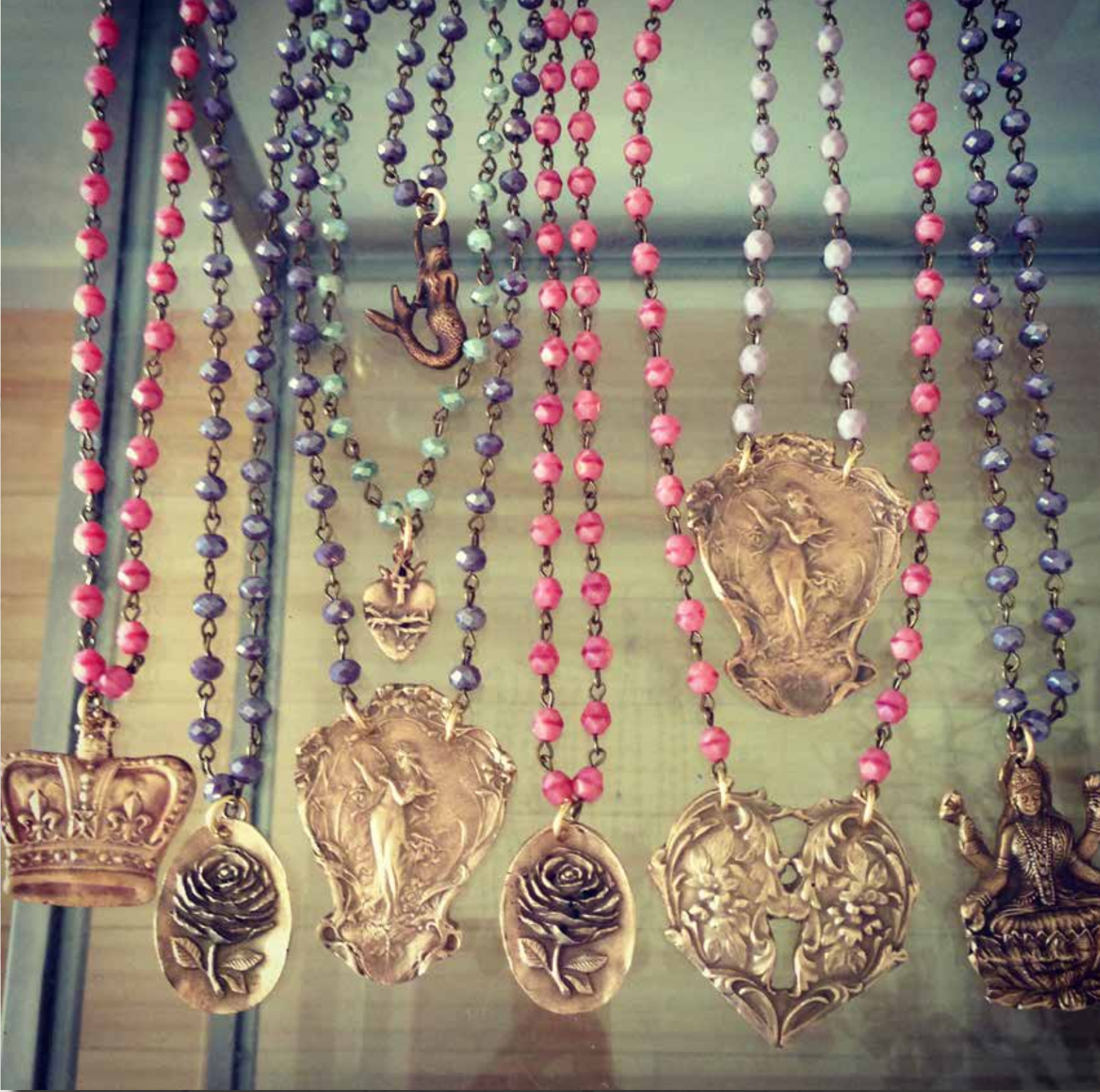
Cast Bronze Medallions - $135.00 - $165.00 Mermaid, Summer Goddess, Sacred Heart, Rose, Heart Space, Lakshmi