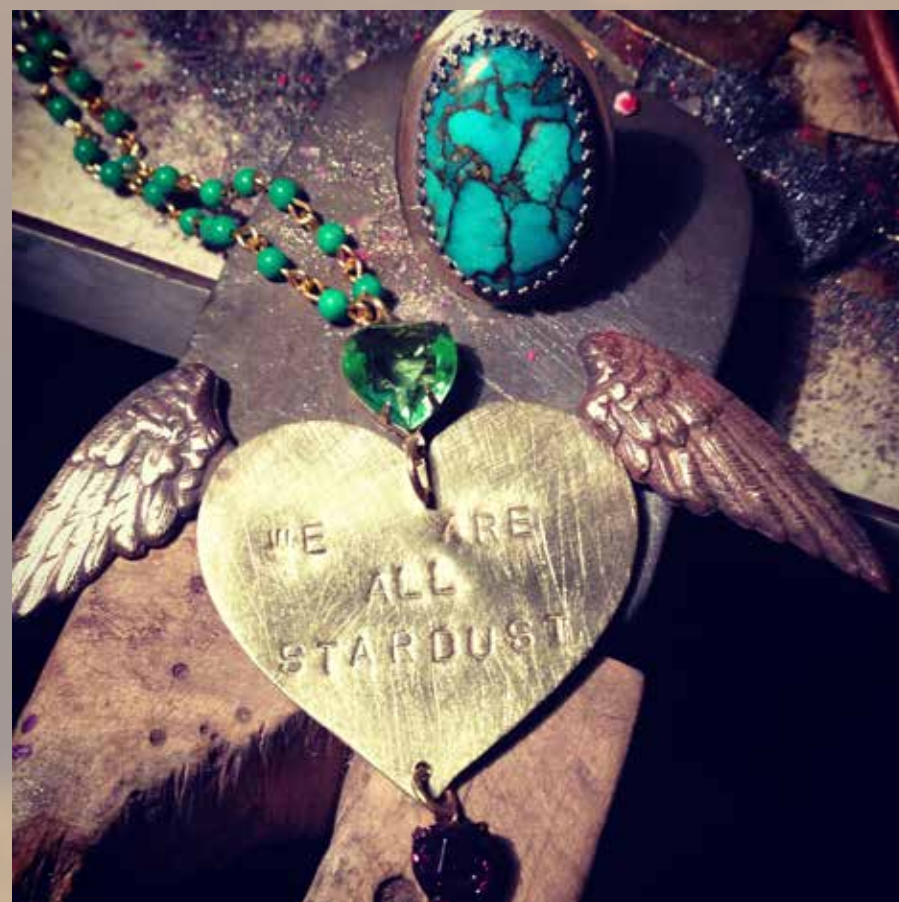
We Are All Stardust Necklace - $165.00 Made from the stuff of stars